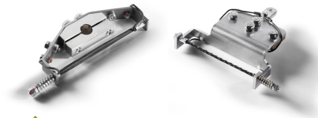
▲ Heavy duty versions for industrial and traction applications

A bundle made of thousands of coated, unidirectional single fibers make contact with the surface of the shaft or other rotating parts of the motors. The good conductivity ensures reliable transmission of the current to defined earthing points and thus protects the bearings from damage caused by micro-arcs (electric discharge machining, EDM)